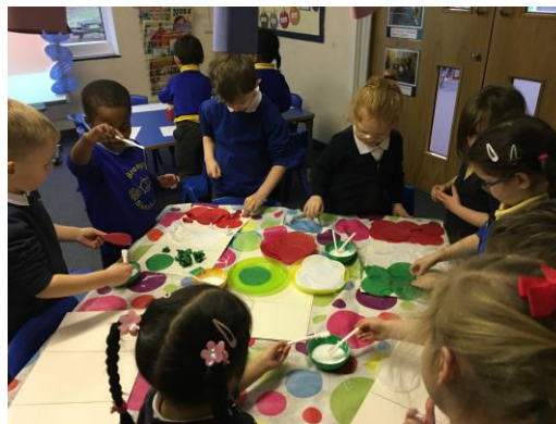
FS2 enjoying multi-cultural week

Remember: You can't tell a goodie from a baddie just by looking at them. If a stranger frightens you, go home and tell your parents or carer right away. If you can't go home, tell someone you can trust, like a police officer in uniform, your teacher or a grown up you know well. This also includes E-Safety and the importance of NEVER agreeing to meet someone you have met on-line without being with a grown up and always telling parents / carers what they are doing on-line.